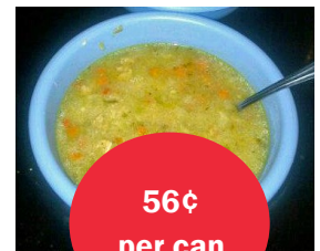
Chicken & Rice Soup 24/10.5oz