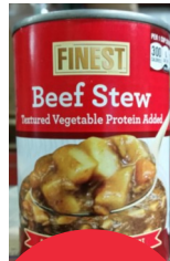
Beef Stew 24/15oz