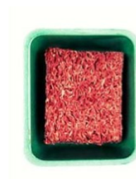
Ground Beef 30/1#