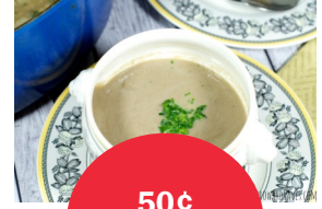
Cream of Mushroom Soup 24/14.5oz