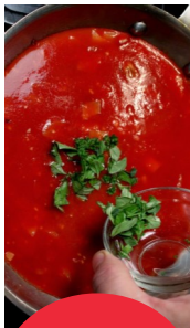
Tomato Sauce 24/15oz