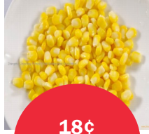
Whole Kernel Corn 24/15.25oz