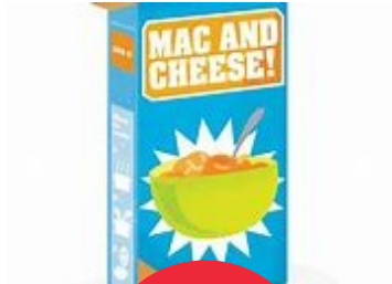
Boxed Mac & Cheese 7.25oz Box