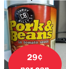
Pork & Beans 12/15oz