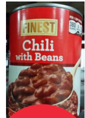
Chili w/ Beans 24/15oz