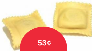
Ravioli w/ beef 24/15oz