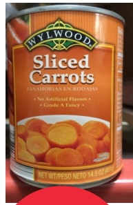
Sliced Carrots 12/15ozoz