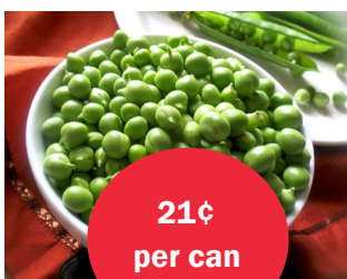
Sweet Peas 24/15oz