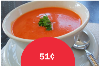
Tomato Soup 24/10.75oz