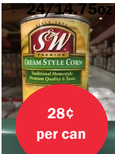
Creamed Corn 24/14.75oz