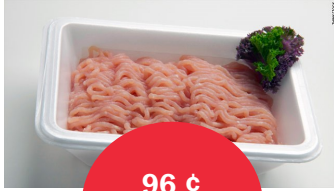
Ground Turkey 12/1# Chubs