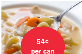
Chicken Noodle Soup 24/10.5oz