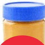
Peanut butter 24/16oz