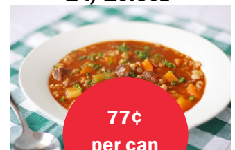
Vegetable Beef Soup 24/10.5oz