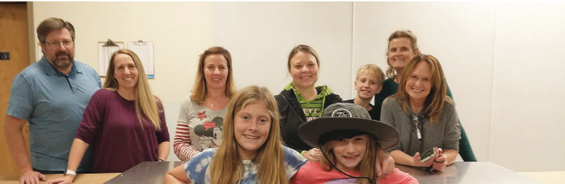
The Steadman family, Pocatello Volunteers