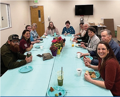
Meridian Team Leads

In fiscal year 2022, volunteers donated 58,302 hours of their time working at The Idaho Foodbank. This is equivalent to the work of 28 full-time employees!